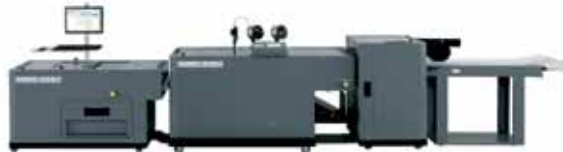
Duplo DBM-5001 Inline Booklet Maker