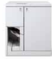
Xerox® Tape Binder