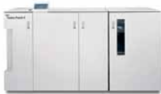
GBC Fusion Punch II with Offset Stacker