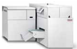
Watkiss PowerSquare 200