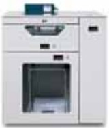
C.P. Bourg BSFx Dual-Mode Sheet Feeder