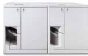
Dual Xerox® Tape Binders