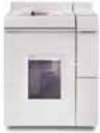
Basic Finisher Module