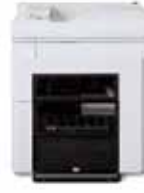
Xerox® Production Stacker