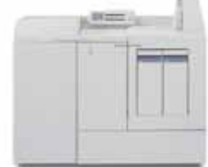
Xerox® DB120-D Document Binder