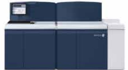
Xerox Nuvera 200/288/314 EA Perfecting Production System