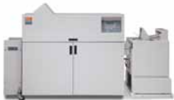
C.P. Bourg BDFNx Booklet Maker with Square Edge