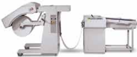
Lasermax Roll Systems SheetFeeder NV-R 1