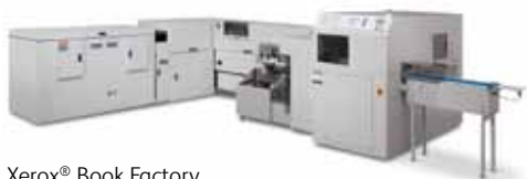
Xerox® Book Factory