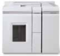
Basic Finisher Module – Direct Connect