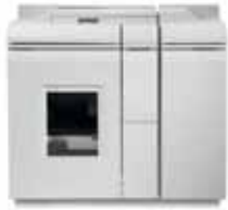
Basic Finisher Module Plus