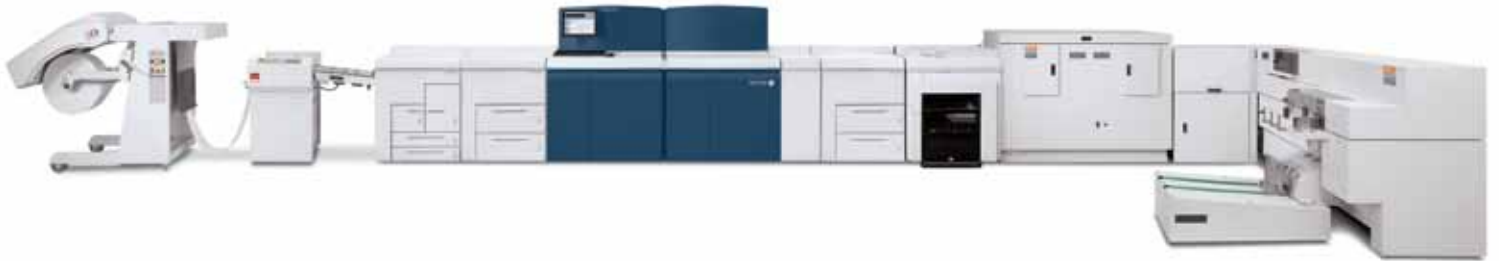
Xerox Nuvera® 314 EA Perfecting Production System with Lasermax Roll Systems SheetFeeder NV-R, Xerox® Production Stacker and Xerox® Book Factory