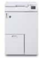
GBC eBinder II